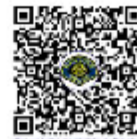
Police Department Permits Unit Unidad de Permisos del Departamento de Policía