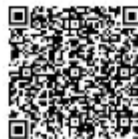
Office of Economic Development and Cultural Affairs Oficina de Desarrollo Económico y Asuntos Culturales

Gracias por tomarse el tiempo de revisar estos requisitos y por colaborar con la Ciudad para operar de forma segura y legal.